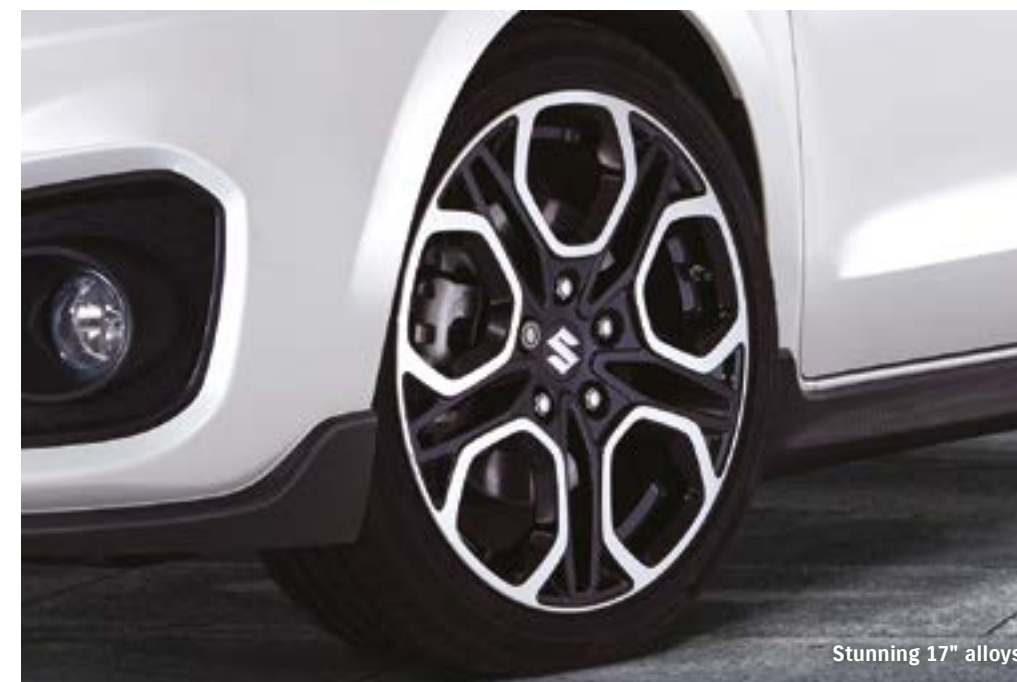
Stunning 17" alloys