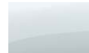
Pure White Pearl Available on all models