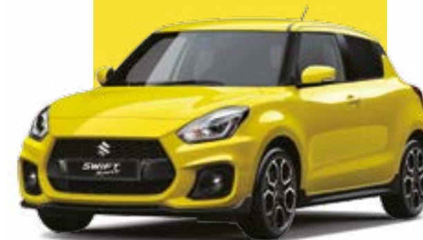
Champion Yellow Available on Swift Sport models only