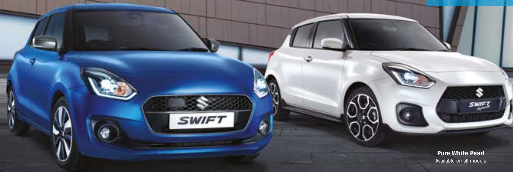
Speedy Blue Metallic Available on all models