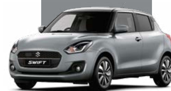
Premium Silver Metallic Available on SZ3, SZ-T and SZ5 models only

WITH A VARIETY OF VIBRANT COLOURS TO CHOOSE FROM, THE SWIFT REALLY LETS YOU MAKE AN IMPACT.