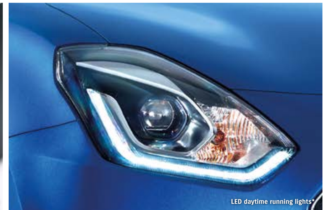
LED daytime running lights*