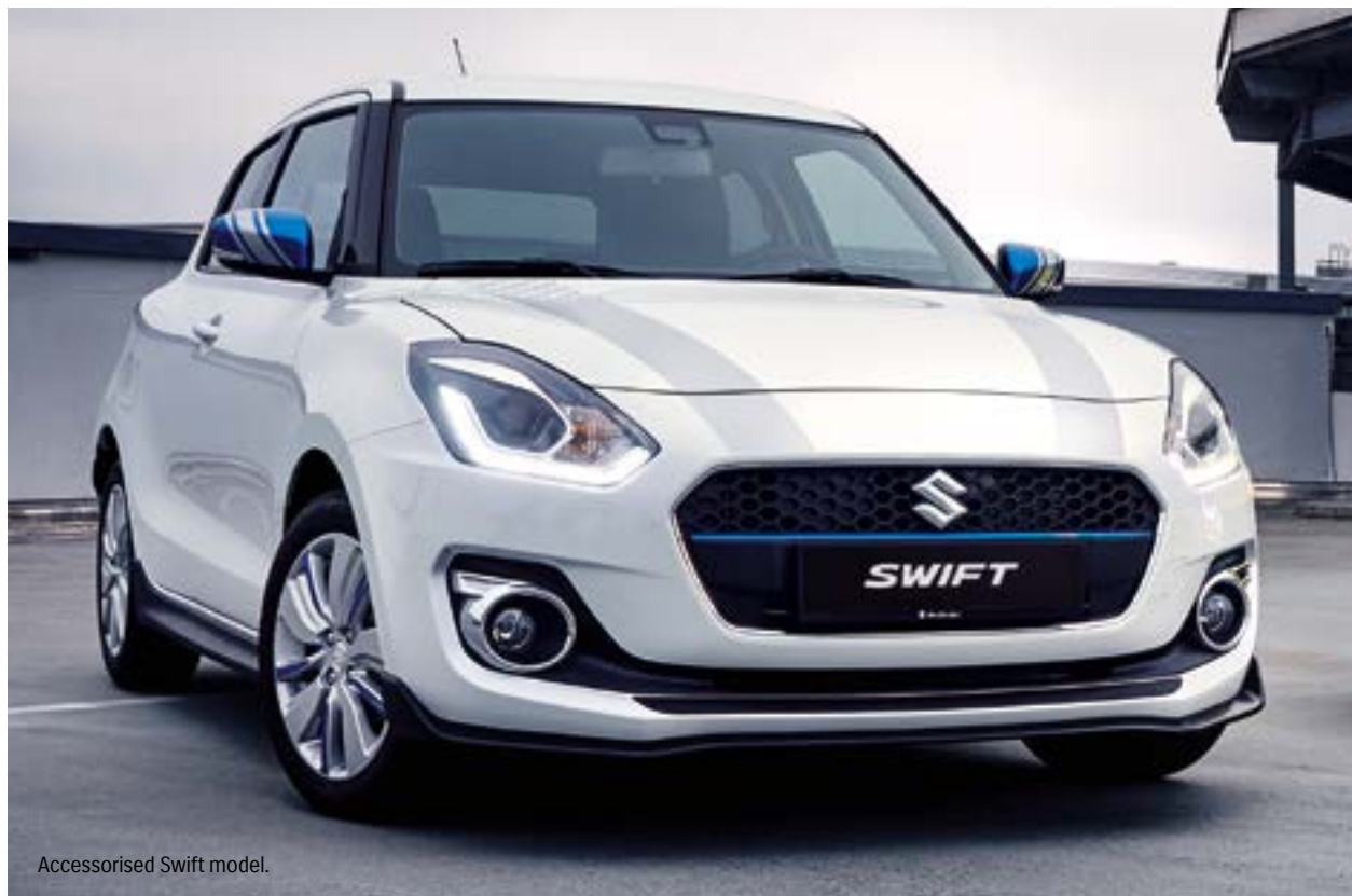
Accessorised Swift model.