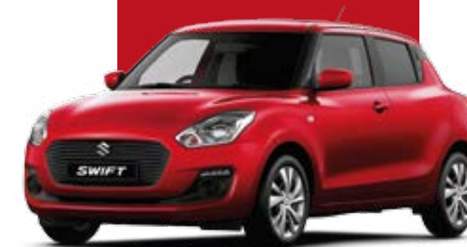
Burning Red Pearl Metallic Available on all models