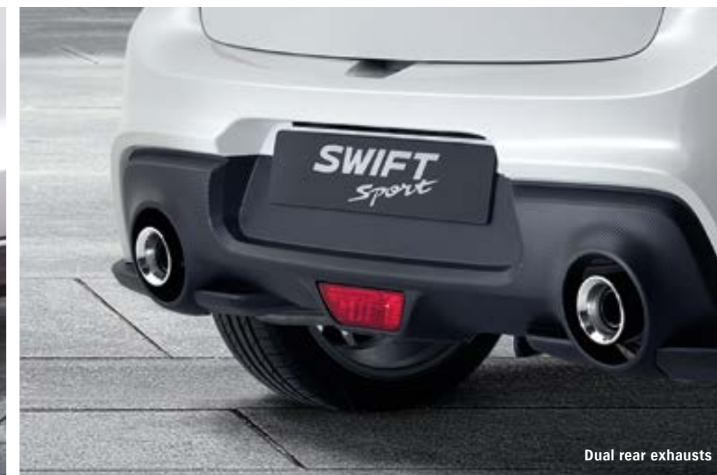
Dual rear exhausts