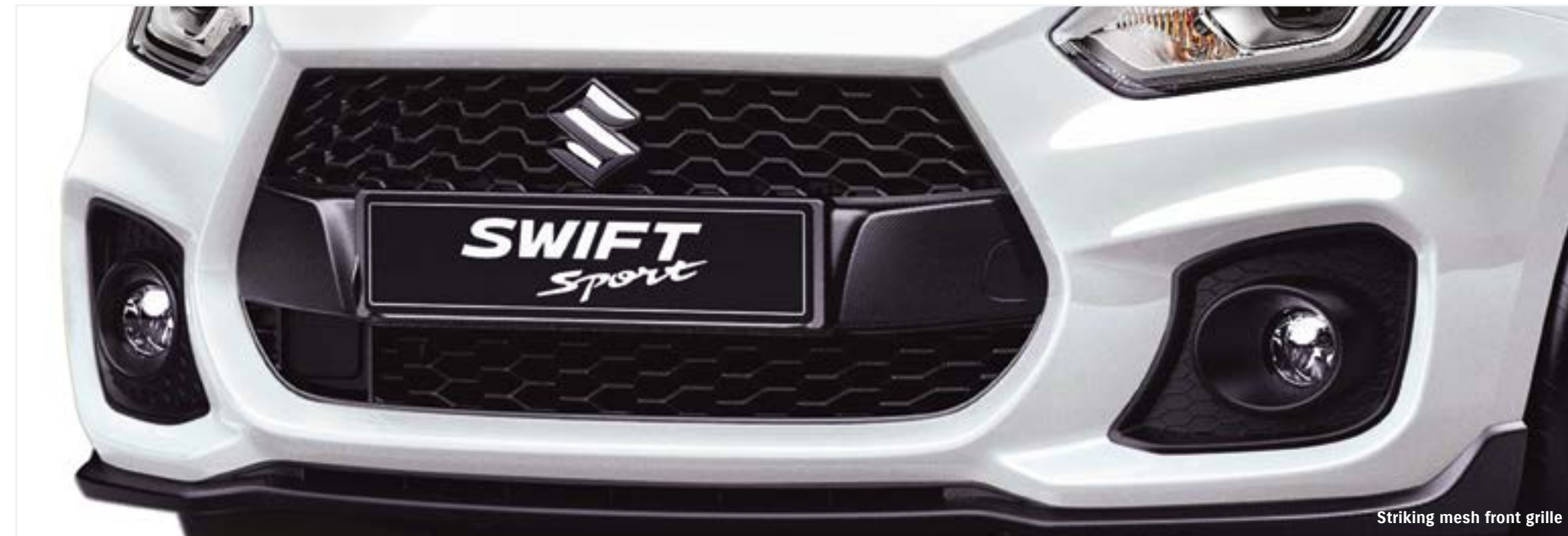
Striking mesh front grille