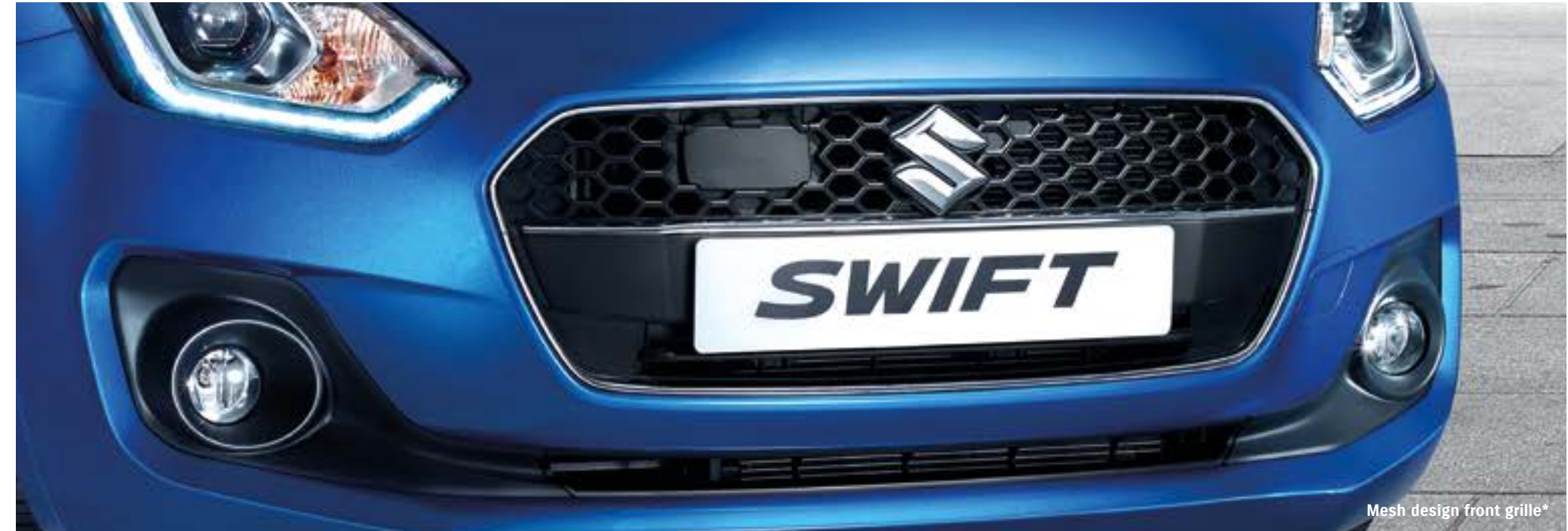
Mesh design front grille*