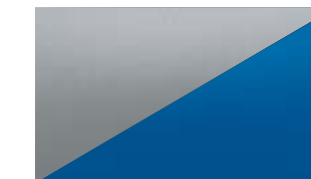
Speedy Blue Metallic with Premium Silver roof Available on SZ-T and SZ5 models only