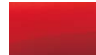
Fervent Red Available on SZ3, SZ-T and SZ5 models only